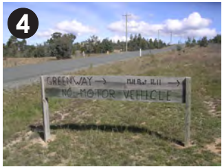
Denley Drive to Millpost Hill, near 379 Denley Drive.