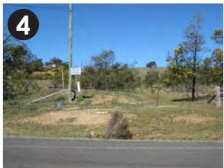
Hogan Drive to Millpost Hill.