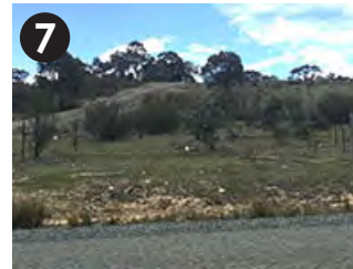
Yuranga Drive, entrance is two properties before McEnally Place.