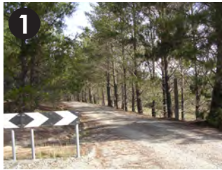
1 190 Newington Road – take the driveway at the end of the road and through the creek.