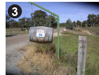
3 441 Weeroona Drive up the driveway to Greenway behind.