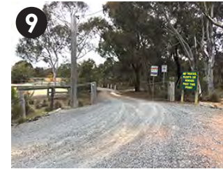
Driveway entrance to Carpark at Bywong Hall, Les Reardon Reserve. Toilet available at Hall.