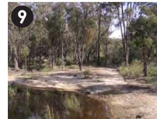
Track starts behind the Bywong Hall, past the horse jumps, past the dam through the gate.