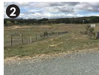
2 End of Waramunga Close.