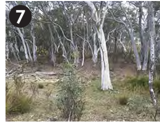
Entrance South side of Birchmans Grove (note not fenced on one side, stay to side with fence).