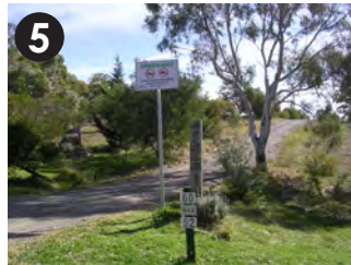
60 Majors Close follow driveway for 150 m to entry gate.