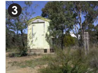
3 Denley and Weeroona junction, starts next to green shed and runs parallel to Weeroona Drive.