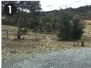
1 End of Birchmans Grove.