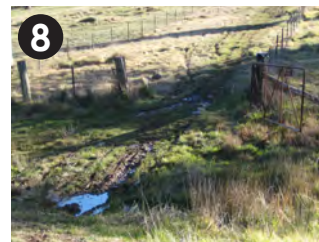
Clare Lane/Valley View Lane. On dirt gated road, closer to Valley View Lane end.