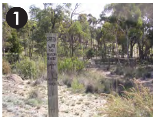
1 Track from Denley Drive starts 100m West of Weeroona Drive, North side near the road sign.