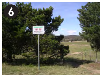
Near 244 Weeroona Drive (East side of road).