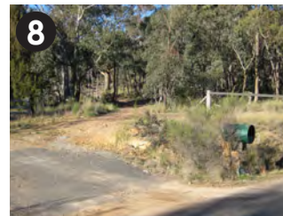
At end of Clare Valley Place. Dirt track to right of green letterbox driveway.