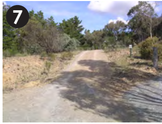
153-154 Harriot Road up the driveway, Greenway starts at the top of the hill.