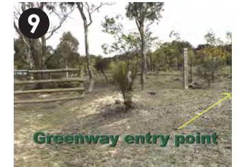
Track starts to right hand side of Kirala (private property) gate.