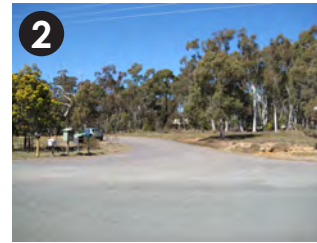
2 Greenway runs along the side of Woolshed Lane.