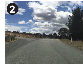
2 Left turn on to Woolshed Lane.