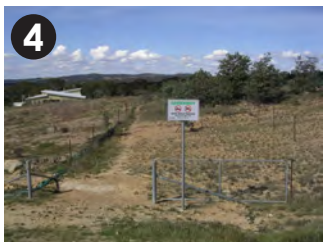
Denley Drive to Track 3, near 379 Denley Drive.