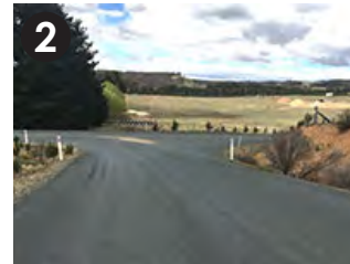
2 Right turn on to Waramunga Close.