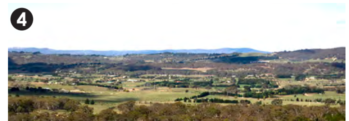
View of Clare Valley, Wamboin, from Millpost Hill.