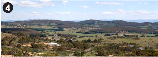
View of Yass River Valley, Wamboin, from Millpost Hill.