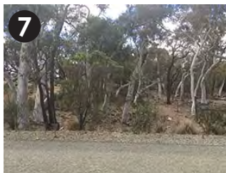
Entrance North side Birchmans Grove.