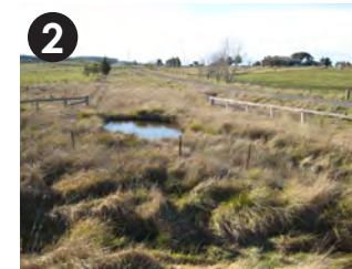
2 Norton Road, small access gate on right hand side near driveway.