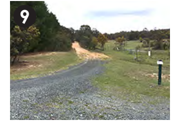
Driveway entrance to 41 Birriwa Road. Les Reardon Reserve to one side.