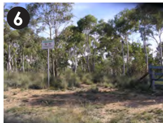
Near 1205 Norton Road.